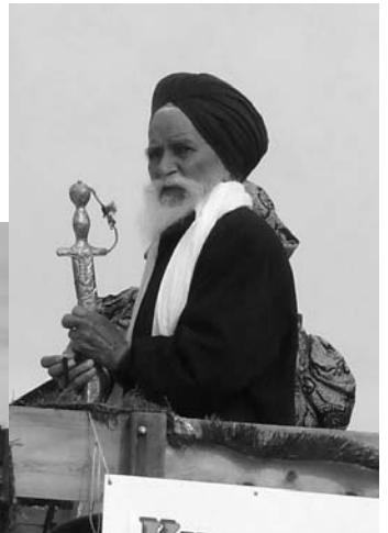
around the World.